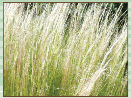
Mexican Feather Grass