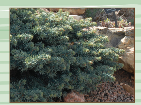
St. Mary's Broom Spruce