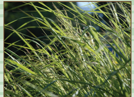
Prairie Sky Switchgrass