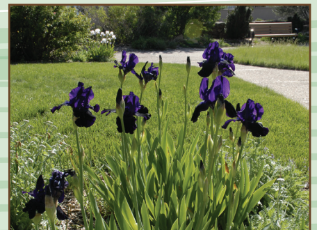
Blue Bearded Iris