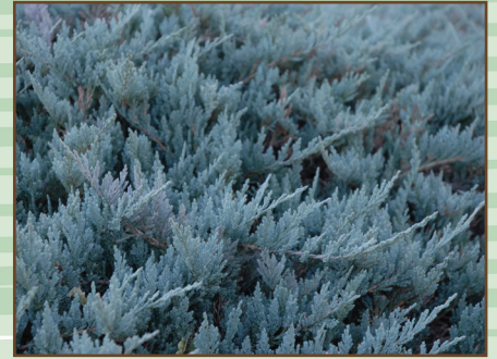
Blue Chip Juniper