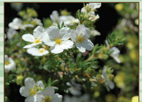
Prairie Snow Potentilla