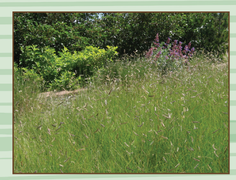
Blue Grama Grass