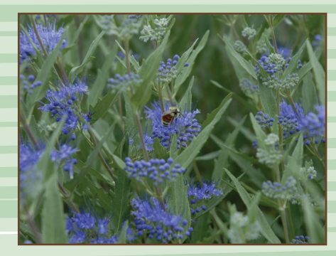
Blue Mist Spirea