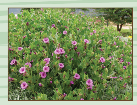
Colorado Four O'Clock