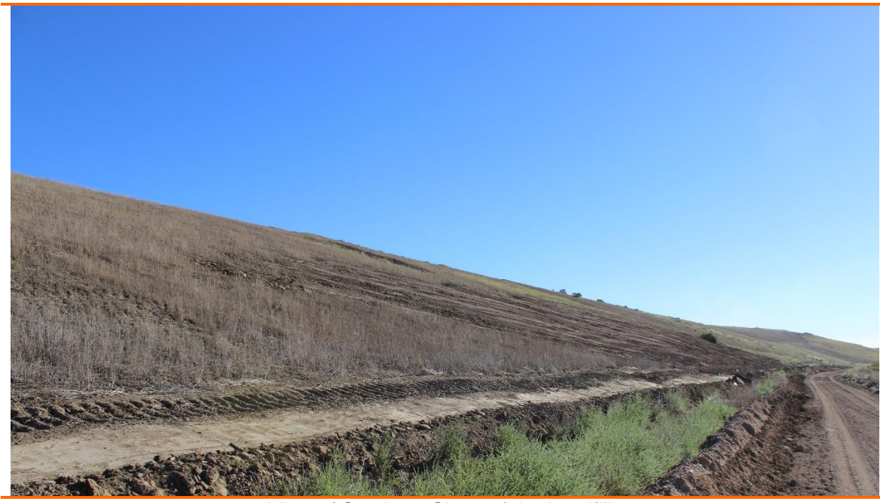
View of Southern Slope of the Landfill