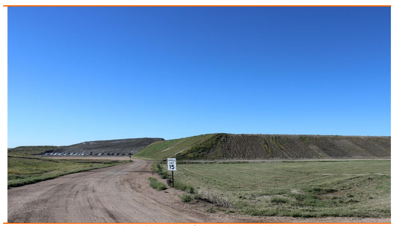
View of Northeast Slopes of the Landfill