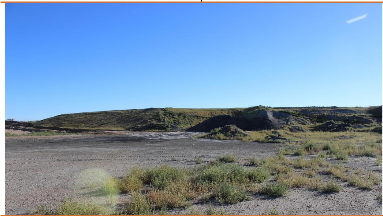
View of Western Slope of Landfill