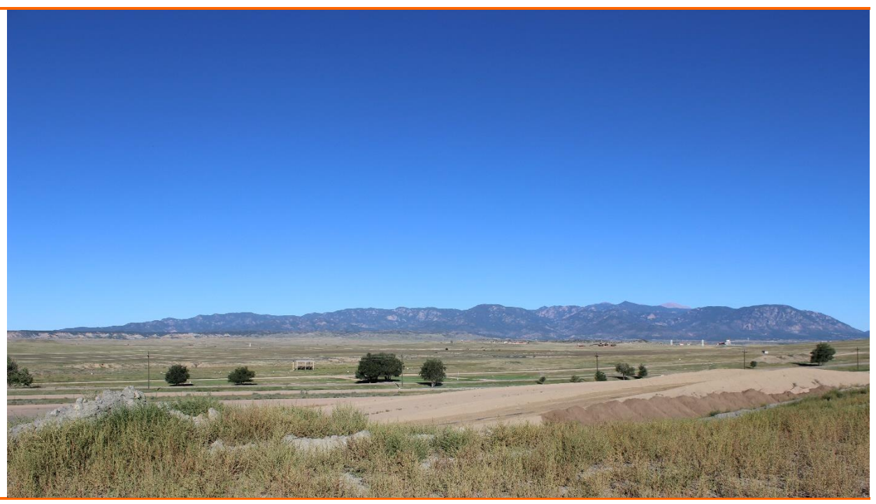
View at Western Crest of Landfill Looking West