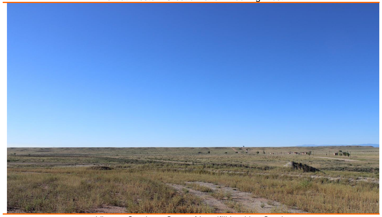
View at Southern Crest of Landfill Looking South