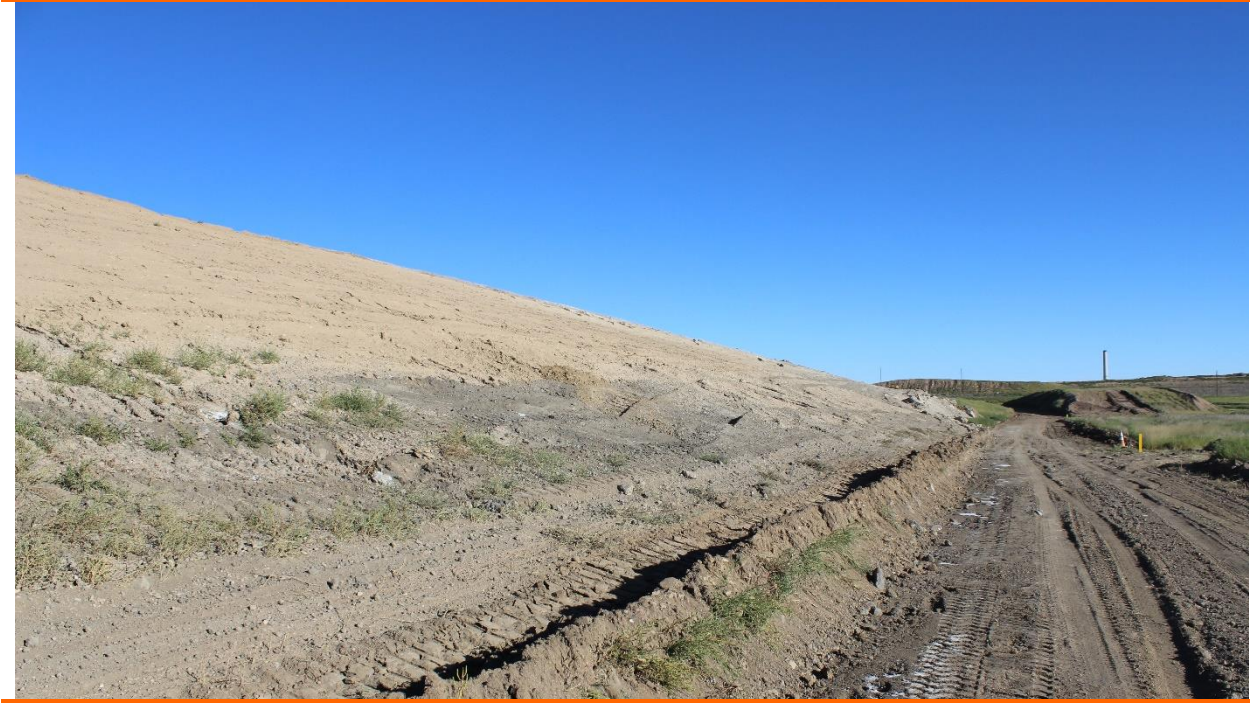
View of Eastern Slope of Landfill