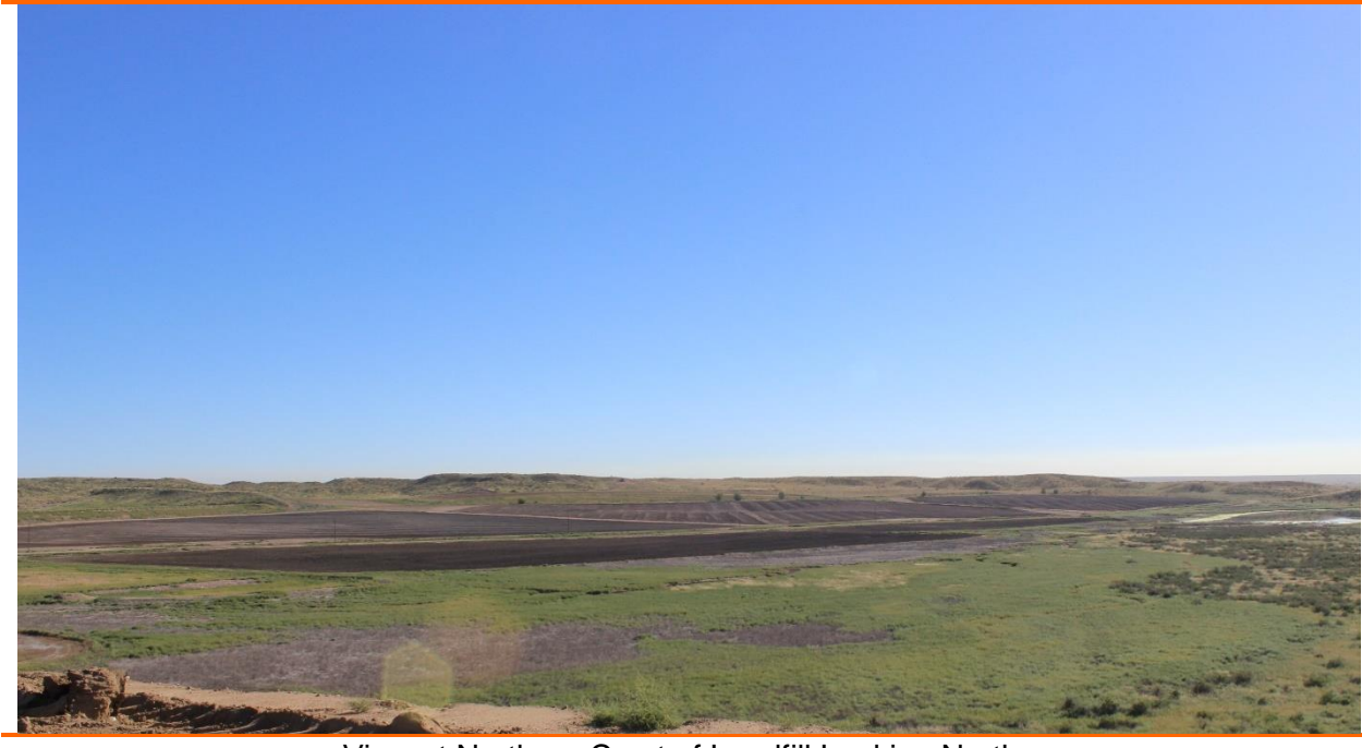
View at Northern Crest of Landfill Looking North